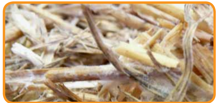
The fungal species used in BioMAX Digest program are hardy, drought resistant and selected from Australian soils.

This cost effective approach reduces the need for supplementary feeding giving obvious benefits in both labour and feeding costs.